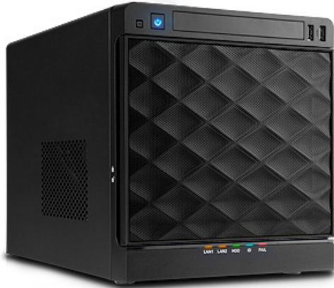
Nobilis i1087TW Mini-ITX Server