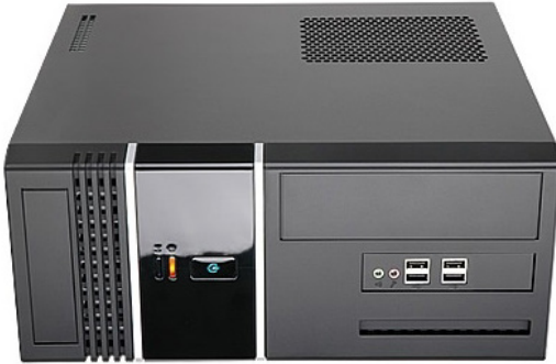
Nobi Care i3104 Desktop PC